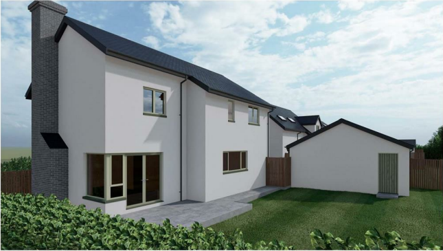
1429 3D VISUALISATION 03