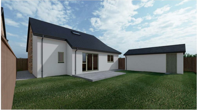
1429 3D VISUALISATION 10